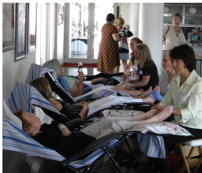
Contributors experiencing profound relaxation from 20-minute reflexology sessions from WRF Volunteer Trainers