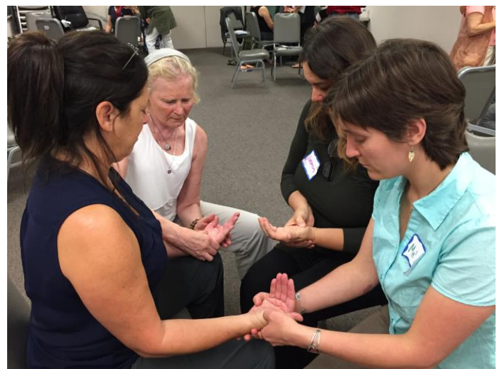
WRF Trainer Trainees practice teaching Self-Help & Family-Help Hand Reflexology