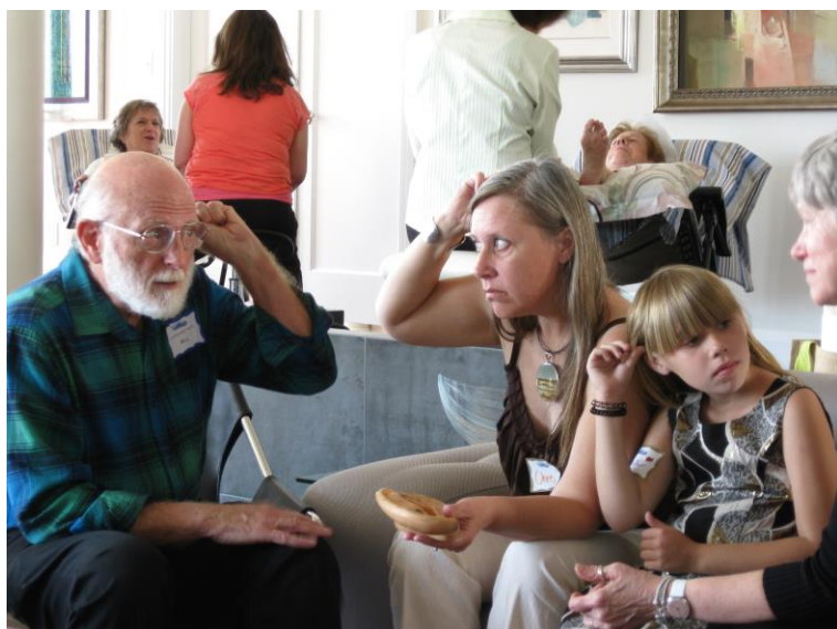
Donors receiving small group or private Self-Help & Family-Help Reflexology teaching sessions from WRF Volunteer Trainers