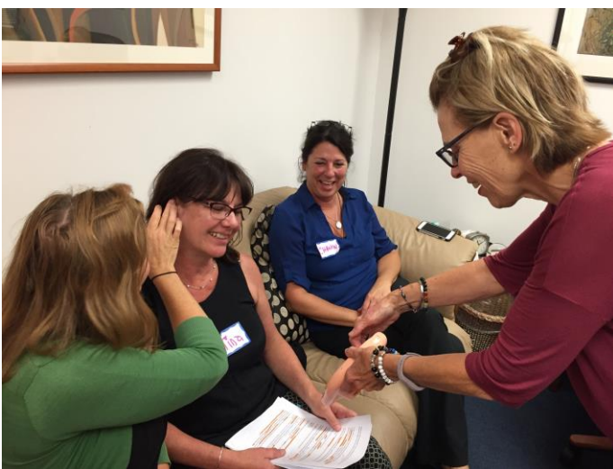
WRF Trainer Trainees practice teaching Family-Help Ear Reflexology