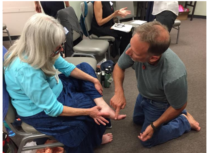
WRF Trainer Trainees explaining thoracic spine reflex locations for Self-Help Foot Reflexology